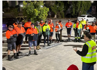
PFD FOOD SERVICES