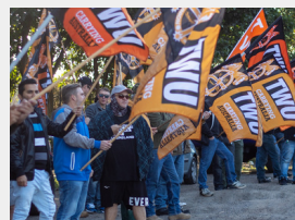
JIM PEARSON TRANSPORT