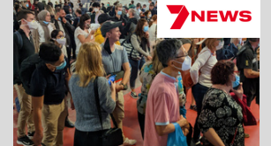
Qantas boss says travellers just 'not match fit' amid Sydney Airport queue chaos - 7 news