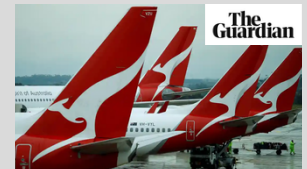
Once upon a time Qantas had a peerless reputation. How did things go so wrong?