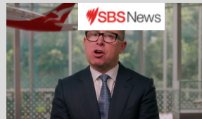
A 'stunt': Union takes aim at Qantas over $50 apology voucher for poor performance