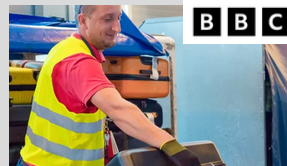
Qantas asks executives to work as baggage handlers for three months