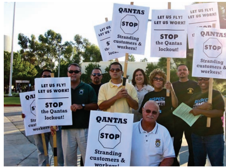
Workers from Teamsters LOCAL 911 AND 2010 PROTEST AT LA AIRPORT over lockout of workers